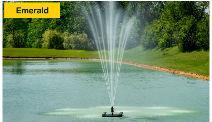
Sterling 1.5hp Shown In Picutres